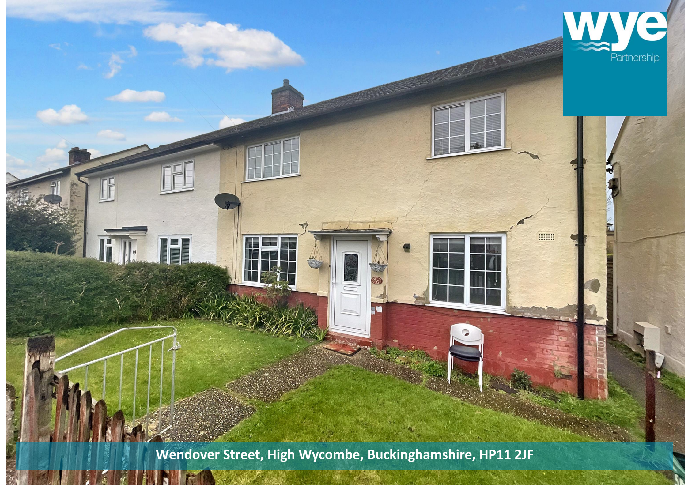
Wendover Street, High Wycombe, Buckinghamshire, HP11 2JF